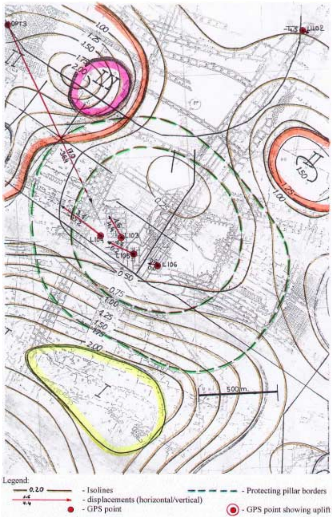
Fig. 2. Example part of LGOM area with GPS Points (Lubin Division)