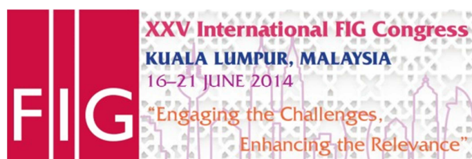
FIG Congress 2014 – Kuala Lumpur, Malaysia 16-21 June 2014 offers a spectacular technical program