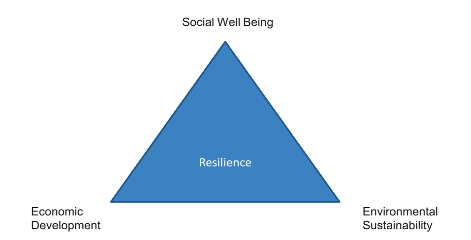
Figure 1: Relationship diagram between social wellbeing, economic development and environmental sustainability (FIG 2008, p. 13).

The concept of resilience provides a useful perspective on sustainable development. At its core is the idea that development processes should not and must not threaten the ability of future generations to share the earth's resources, as previous generations have been able to. State and regional governments, multi-national corporations, local industry and the individual inhabitants are under increasing pressure to balance economic growth with social responsibility, including good governance, ethical practices, and respect for human rights and traditional cultures. Resilience can be regarded as an operational tool for recognising, improving and measuring corporate sustainability. Resilience is basically about recovering from and adapting to change. It is stressing the importance of achieving effective change for social and economic stability and environmental improvements. There is an inextricable relationship between social wellbeing, economic development and environmental sustainability as shown in Figure 1.