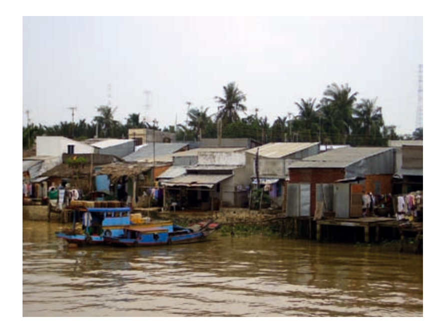
FIG PUBLICATION 51

The 7<sup>th</sup> FIG Regional Conference 19–22 October 2009, held in Hanoi, Vietnam focused on "Spatial Data Serving People: Land Governance and the Environment – Building the Capacity". This theme was chosen to address some of the key professional issues in East Asia and especially in the host country of Vietnam. The conference recognized that these regions require urgent action especially in terms of reinforcing methods for land acquisition in fast growing urban areas in developing economies.