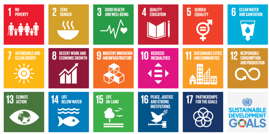
Figure 1. The 17 Sustainable Development Goals.

The UN's Sustainable Development Goals for 2030 (SDGs) place sustainable development at the top of the agenda for governments, companies and populations