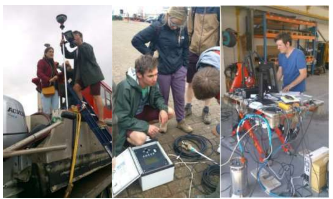
Figure 2. – Activities during the "Integrated Fieldwork" bathymetric week in the harbour of Ostend.