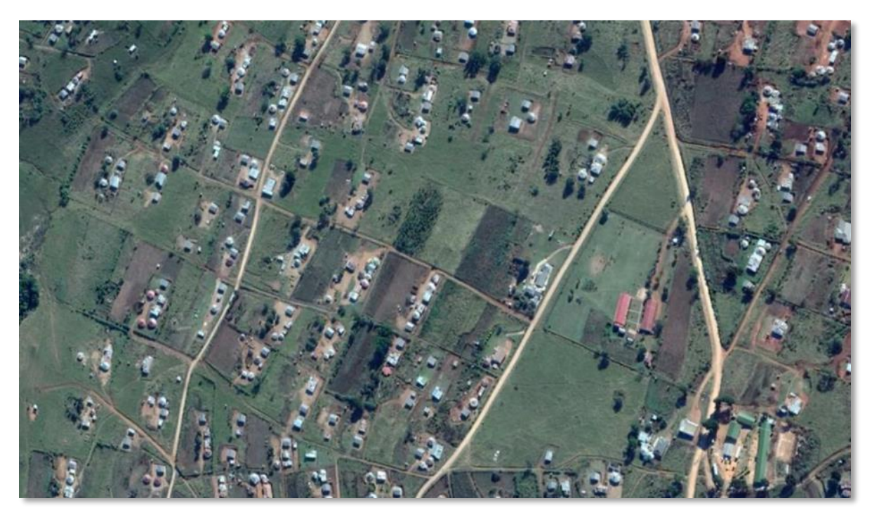
FIGURE 1: A TYPICAL SETTLEMENT ON COMMUNAL LAND IN THE MANYAVU AREA OF KWAZULU-NATAL

Therefore, the country has usable rectified imagery from which all visible boundaries can be determined.