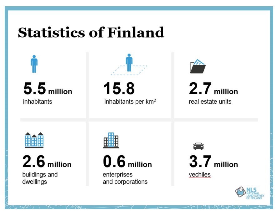
Figure 2. Statistics about Finland

In parcelling processes, cadastral surveyors are obligated to find a solution in parcelling issue. This means that they cannot assign their cases to other surveyors. But if in title and mortgage issues a case exceeds the competence level of a surveyor, they must assign it to a specialist or legal counsel for further processing. It is estimated that roughly 95% of all registrations are normal cases that do not need to be reassigned.