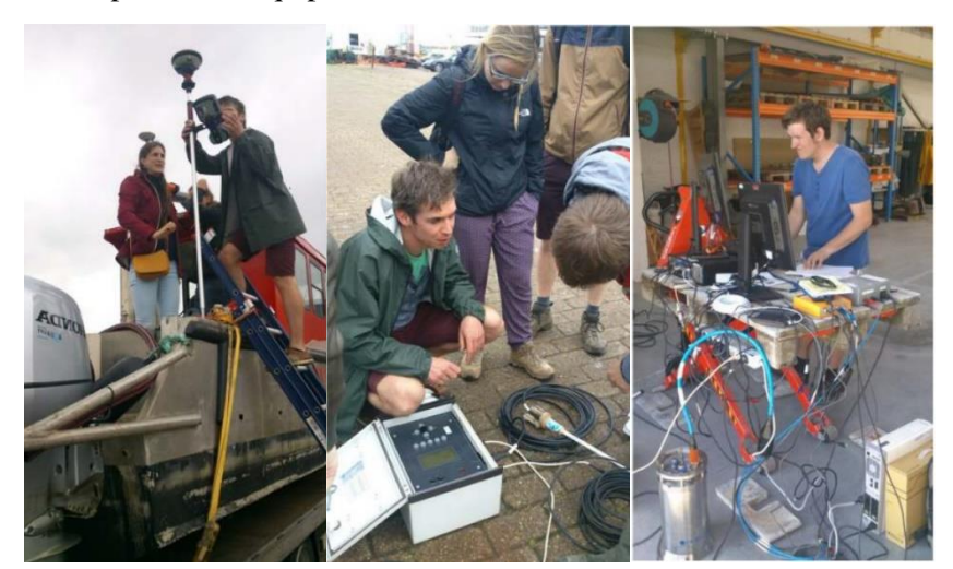
Figure 2. – Activities during the "Integrated Fieldwork" bathymetric week in the harbour of Ostend.