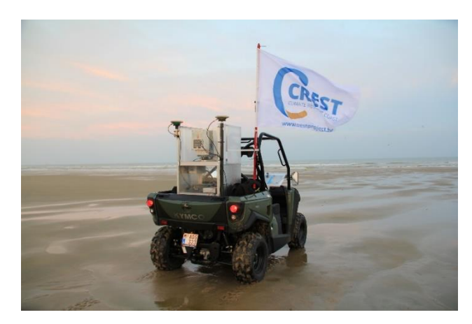
Figure 3: Long-range static and Mobile LIDAR for beach monitoring