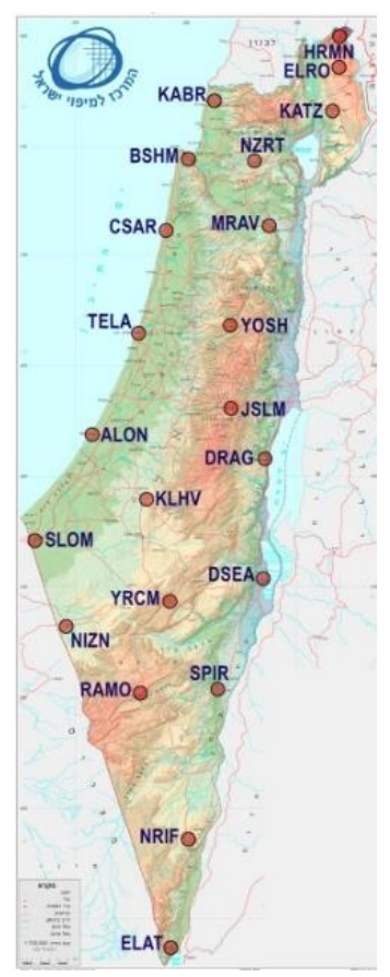
Figure 1: The primary horizontal control in Israel is a network of 22 CORS

Further details about occupation time, difference between survey stations and so on are provided by the Director General Instructions, these are comparable to Caltrans 2012.