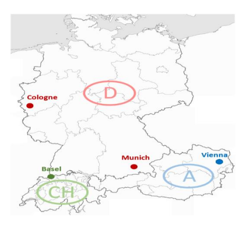
Fig. 2: Investigated cities in DACH-countries.

All criteria that describe threshold households in general, as well as the external factors relating to the housing market and the cost of living, have been described in the previous chapter. But how is the situation in Munich and Cologne in Germany, as well as in Basel in Switzerland and in Vienna in Austria (fig. 2)? Are there differences in the characterization of thresholds in these four cities?<sup>1</sup> In Munich, Cologne, Vienna and Basel, around half of the inhabitants have low incomes and almost two-thirds live for rent. According to the GfK Purchasing Power Study 2017 of the market research institute GfK, the city