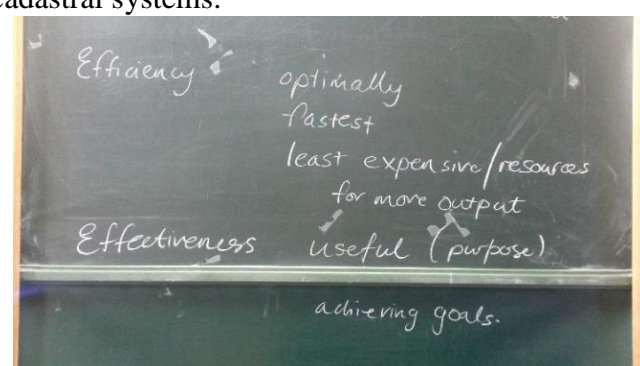
Figure 3: green board reflection of the exploration of good governance principles in student pairs