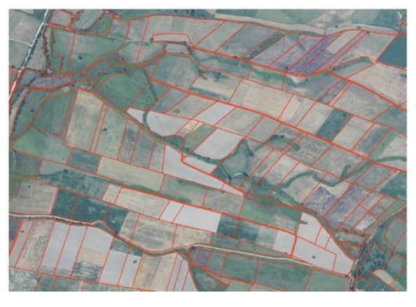
Fig. 4: Orthophoto with plots and boundaries