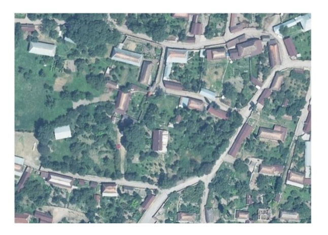
Fig. 5: Orthophoto with village