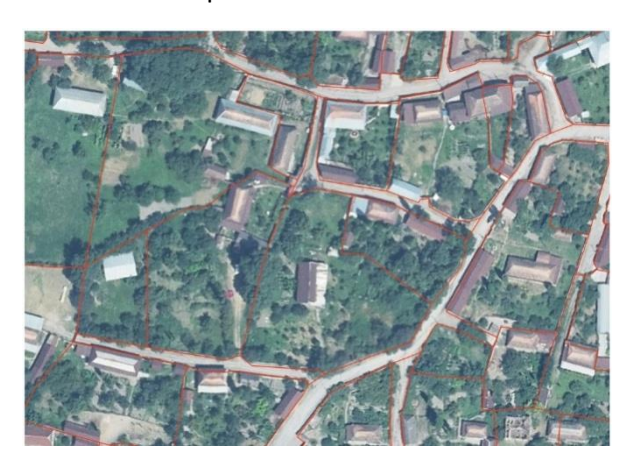
Fig. 6: Othophoto with village and Boundaries

The used surveying systems have an integrated laser distance meter. This allows surveying also such points that can't be surveyed directly with the GNSS-rover, using indirect methods like intersection or extension. Alternatively electronic tachymeter can be used in areas of dense construction or vegetation.