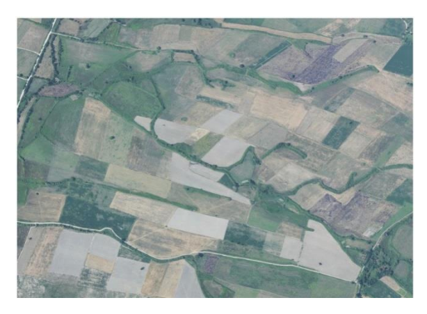
Fig. 3: Orthophoto with agricultural plots