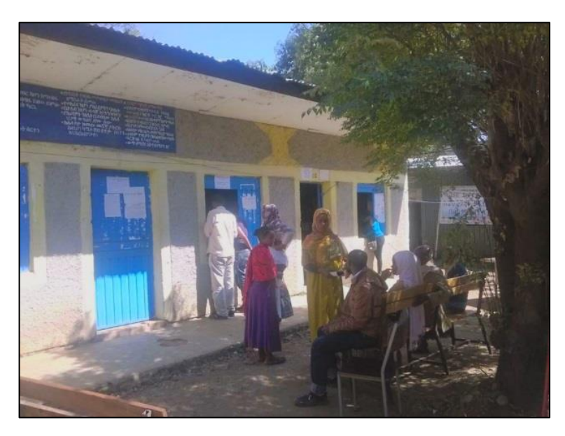
Landholders waiting at Fasilo Land Office, Bahir Dar

related file, as the numbering system may have been revised multiple times. Some of these registry books in the city archives were so old that they had become unreadable and were falling apart.