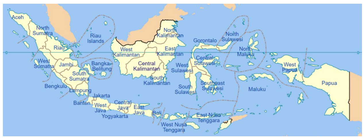
Figure 5. Map of Indonesia with its 34 provinces.

The Republic of Indonesia, located in South East Asia and around Equator. The country is close to 2 mill square kilometers, and with a population of around 260 million people, Indonesia is the world's fourth most populous country. Administratively, Indonesia consists of 34 provinces with its own legislature and governor. The provinces are subdivided into regencies and cities, which are further subdivided into districts and again into administrative villages (Wikipedia). It is estimated (Gresik District Land office, East Java Province) that Indonesia has about 120 million land parcels of which about one third are registered and only about half of these are spatially identified. About 3 million new parcels appear each year.