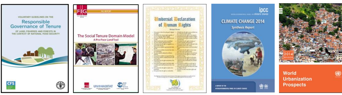
Figure 2. The wider global agenda includes a range of land related issues.

There is a strong request for effective monitoring and assessing progress in achieving the SDGs. There is a need for reliable and robust data for devising appropriate policies and interventions for the achievement of the SDGs and for holding governments and the international community accountable. Such a monitoring and evaluation framework is crucial for encouraging progress and enabling achievements at national, regional and global level. Therefore, about 240 indicators are developed to enable measuring the progress of achieving the targets. This progress will be presented in an annual progress report from the UN. Also, the World Bank, in conjunction with UN and other partners, has developed the Land Governance Assessment Framework (World Bank, 2011) for benchmarking and monitoring the core areas, such as the legal and institutional frameworks. The wider global agenda includes a range of land related issues as briefly presented below and illustrated Figure 2.