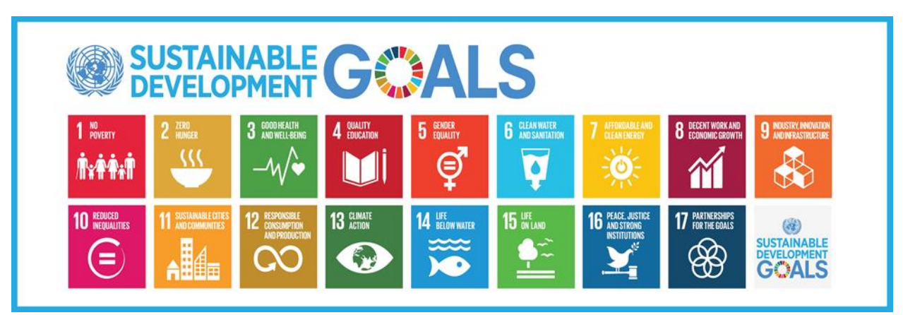
Figure 1. The Sustainable Development Goals (UN, 2015).

The Millennium Development Goals (MDGs) ended by 2015 and are now replaced by the Sustainable Development Goals (SDGs) with a new, universal set of 17 Goals and 169 target that UN member states are committed to use them to frame their agenda and policies over the next 15 years, see Figure 1. The goals and targets integrate economic, social and environmental aspects and recognise their interlinkages in achieving sustainable development in all its dimensions (UN, 2015). While the MDGs did not mention land directly, the SDGs include a number of goals with a direct reference to the land issues. Land governance is now placed at the very top of the global agenda.