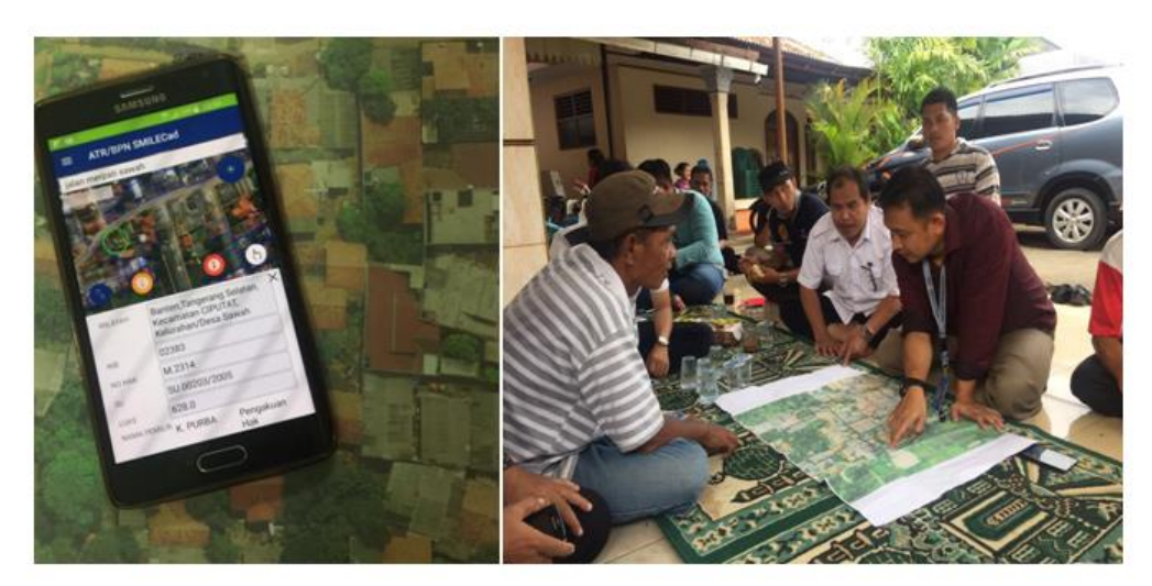
Fig. "Smile Cadastre" display and socialising parcel based map participatory mapping

During the first year (2016) of census programme, out of 59.448 parcels located in Ciputat Sub-district 42,78% or 25.435 parcels have been inventoried with land ownership documents (Kantah Tangsel, 2017). Parcels which fulfil the requirements will basically be allocated to register through systematic registration programme. Only if landholders intend to shortly obtain their land certificate, sporadic registration is suggested. In 2017, 62.866 parcels located in 2 sub-districts, Ciputat Timur and Setu, are targeted to participate in the project.