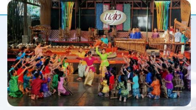
Sundanese Ethnic Culture Hub