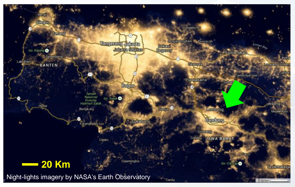
Metropolitan Area with population of 5.7 million lives (2010, National Census)