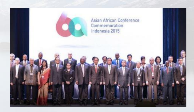
The Asian African Conference