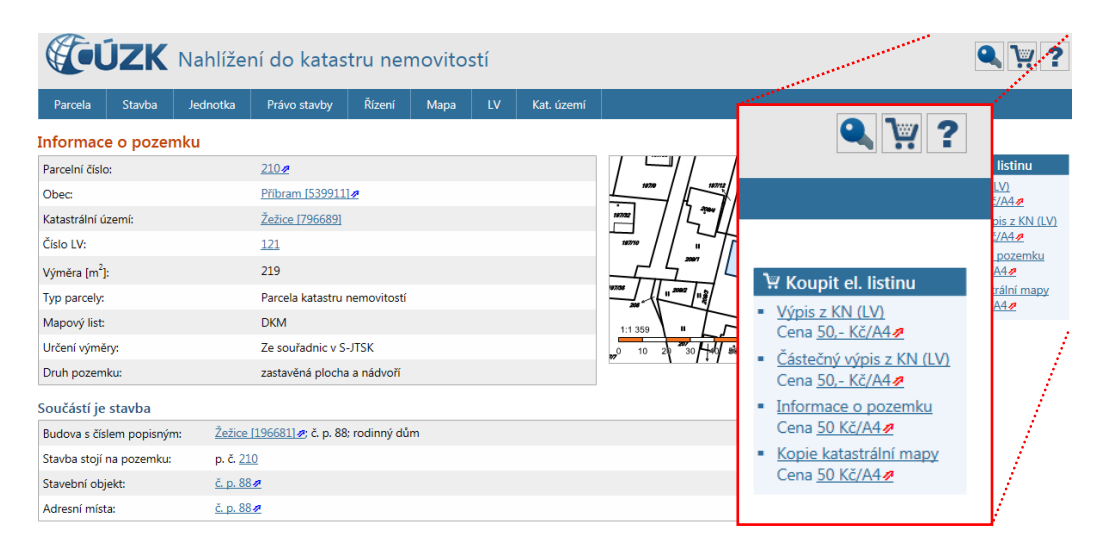
Fig. 6 Access to payment portal