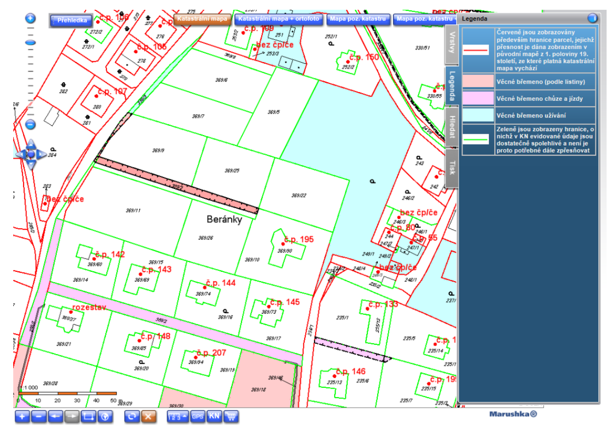
Fig. 4 Cadastral Map with highlighted elements

Besides a general map viewing you can search parcels and buildings, display the quality of the measurement of boundaries (red-bad/green-good boundaries) or display easement to the property (blue/pink/orange coloured area).