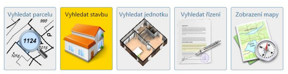
Fig.1 Graphical menu for information about parcels, buildings, flats, cadastral procedures and cadastral map