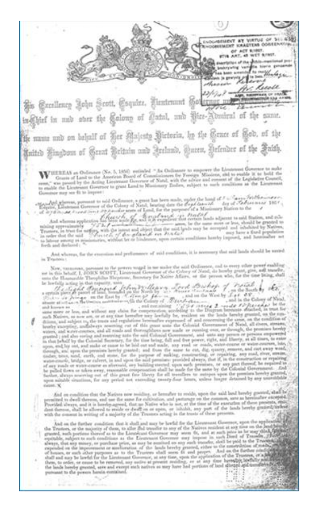
Figure 5: Front page of the "Inanda Native Location" title deed, dated 1864

Similarly, the following is extracted from the Deed of Grant No. 8309 dated 4<sup>th</sup> November 1862, and being the grant for Umlazi Mission Reserve: "... Whereas an Ordinance (No. 5, 1856) entitled "An Ordinance to empower the Lieutenant Governor to make Grants of Land to the American Board of Commissioners for Foreign Missions, and to enable it to hold the same," was passed by the Acting Lieutenant Governor of Natal, with the advice and consent of the Legislative Council, to enable the Lieutenant Governor to grant Land to Missionary Bodies, subject to such conditions as the Lieutenant Governor may seem fit to impose ... "And whereas application has been made for, and it is expedient that certain lands ... should be granted to Trustees, in trust for natives, with the intent and object that the said lands may be occupied and inhabited by Natives, in order that the said Church of England in Natal may have a fixed population to labour among as missionaries, without let or hindrance, upon certain conditions hereby imposed, and hereinafter set forth and declared ... Now, therefore, pursuant to the powers vested in me under the said Ordinance, and to every other power enabling me in this behalf, I, John Scott, Lieutenant Governor of the Colony of Natal, do hereby grant, give, and transfer ... unto the Right Reverend John William, Lord Bishop of Natal, a certain piece or parcel of land ... on condition that the Natives now residing, or hereafter