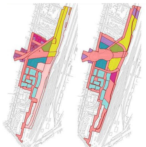
Figure 3: Proposal for Urban Land Readjustment in one of the 12 pilot cases. Shown left: ownership before reallocation, shown right: ownership after reallocation (Van der Stoep e.a., 2013).

After the pilot program the minister establishes a commission for Urban Land Readjustment. This commission has to give advice to the minister which kind of legal rules are necessary for successful urban land readjustment.