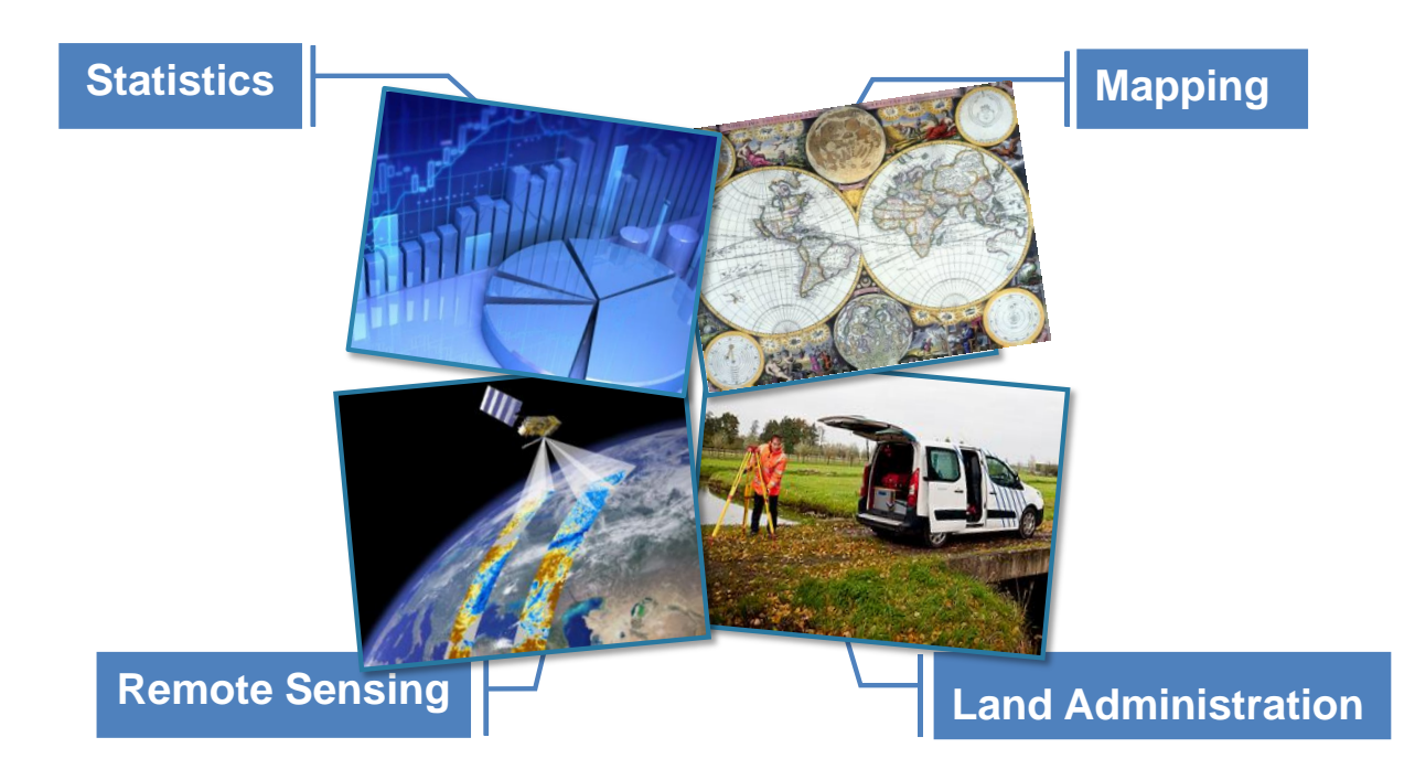
Figure 1. Professional worlds converge.

Looking at the trends in the arena of governmental organisations, academia and private sector, it becomes clear that professional worlds converge: Statistics, Geo-sciences, Remote Sensing and Land Administration experts come to together more and more in order to achieve challenging goals like the United Nations Sustainable Development Goals (SDG's).