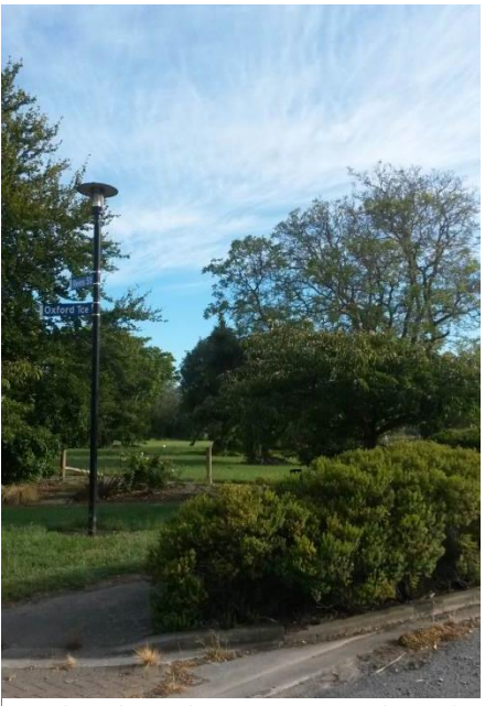
2. Light poles and street signs stand proud despite houses and people no longer present.

The most obvious consequence of those disastrous events is the suburbs of desolation. They no longer resemble war zones with abandoned buildings, inaccessible roads, roadside piles of liquefaction and collections of portable toilets that I witnessed on earlier visits to the city. Now they are grassed areas complete with original street signs, backyard trees still standing, service connections boxes remain at the boundary but nothing else. These scenes are almost as unnerving as the destruction was. A neighbouring territorial authority in the same situation has recently released a consultation document to transform abandoned suburbs into recreation areas, cemeteries and rural land.