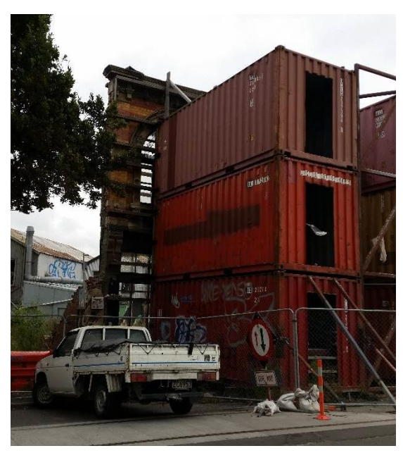
4. Containers are not just for shipping – a common use around the city is as temporary support of historic facades

Rebuilding a city is complicated. I'm impressed that a selection of contractors and consultants and government agencies combined to form SCIRT (Stronger Christchurch Infrastructure Rebuild Team) to formulate and implement a complex and essential citywide repair and rebuild programme for roads, fresh water, wastewater and storm water networks. As of early February 2016 SCIRT is