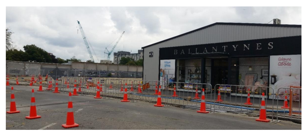
5. The familiar multilevel Lichfield St Car Park now a bare site waiting for its next occupation. Beside it, a rebuilt portion of Ballantynes has access affected while building construction on both sides of the road is under way.

A personal challenge I have discovered since moving to the city is knowing what to ask and how to respond? Is it ok to ask someone about their story? Perhaps they lost a close friend or family in the February quake, or perhaps they were part of the search and rescue effort that day. Are they comfortable talking about their experiences? There is a saying that a man's house is his castle. But many people have had their castle ripped from them either by the quake or by lack of insurance or other tragic circumstances.