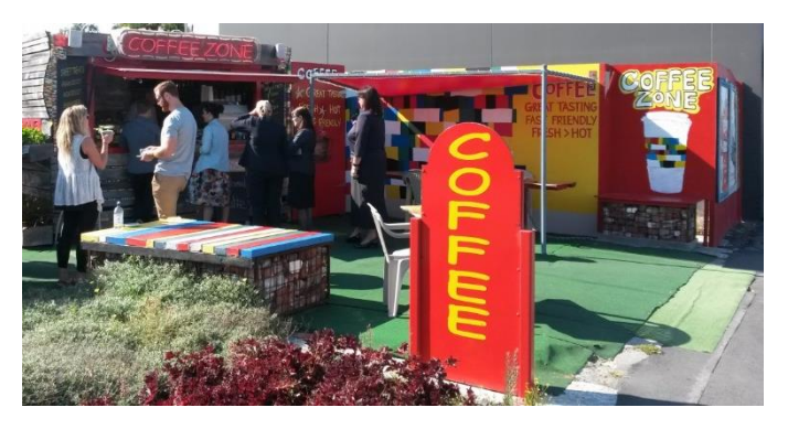
9. A favourite morning coffee escape from the office, including a street busker on Thursday mornings! These hardly souls are known to happily brave the winter weather for a good coffee. Who knows how long before construction will start on this commercial site?

As a result of the CBD demolition the amount of dead space in CBD has been reduced — many blocks had narrow buildings difficult to repurpose but the vast expanse of open space allows the city to find new uses for old buildings