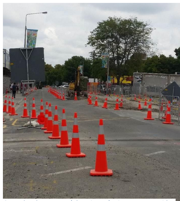
6. Roadworks – you can't beat it, you've just got to go with

A school mum informed me of a frustration I hadn't recognized - the extent that community activities had been reduced or merged. As a result of buildings being destroyed or damaged in the earthquakes or discovered to be below building code requirements, services facilities that were not shut down have relocated. Relocation means facilities are now often in locations not designed for the new use, access and parking is less than adequate and in some instances located in a suburb across the other side of town forcing the public to consider whether they make the effort to attend. Of course, there are instances where the activity is no longer viable. An example of this is the absence of a 50m swimming pool – without an Olympic size pool, professional swimmers are unable to train and now reside in other towns and cities where there are suitable facilities.