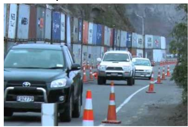
1. The line of shipping containers imposes on access to and from popular Sumner Beach but protects road users from rock fall

Employers had to be understanding and considerate of everyone's situation – some staff needed time off to clear their homes and property of liquefaction; leave to seek treatment for physical or emotional illness; leave to meet with lawyers, insurers, contractors; and tried their best to arrive at work on time despite the appalling road conditions, bridge closures and detours.