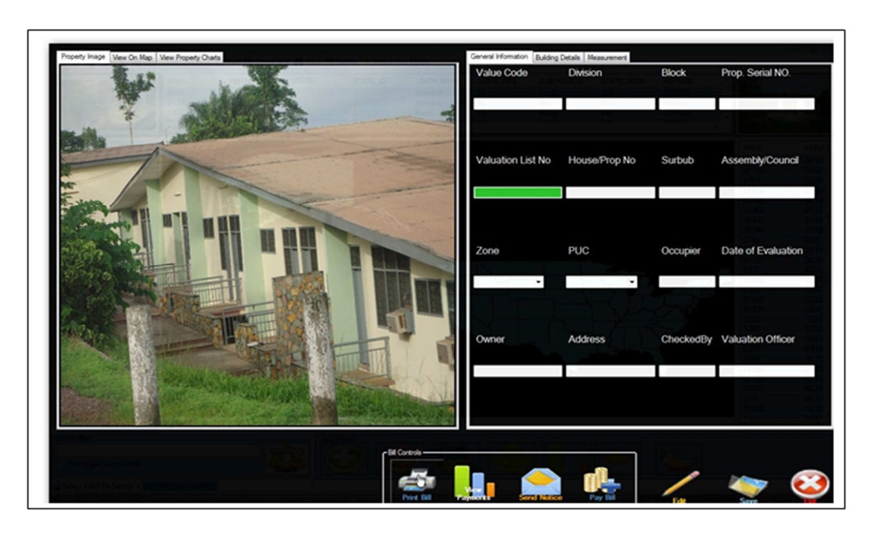
Fig. 6: Window containing general information about the current selected property