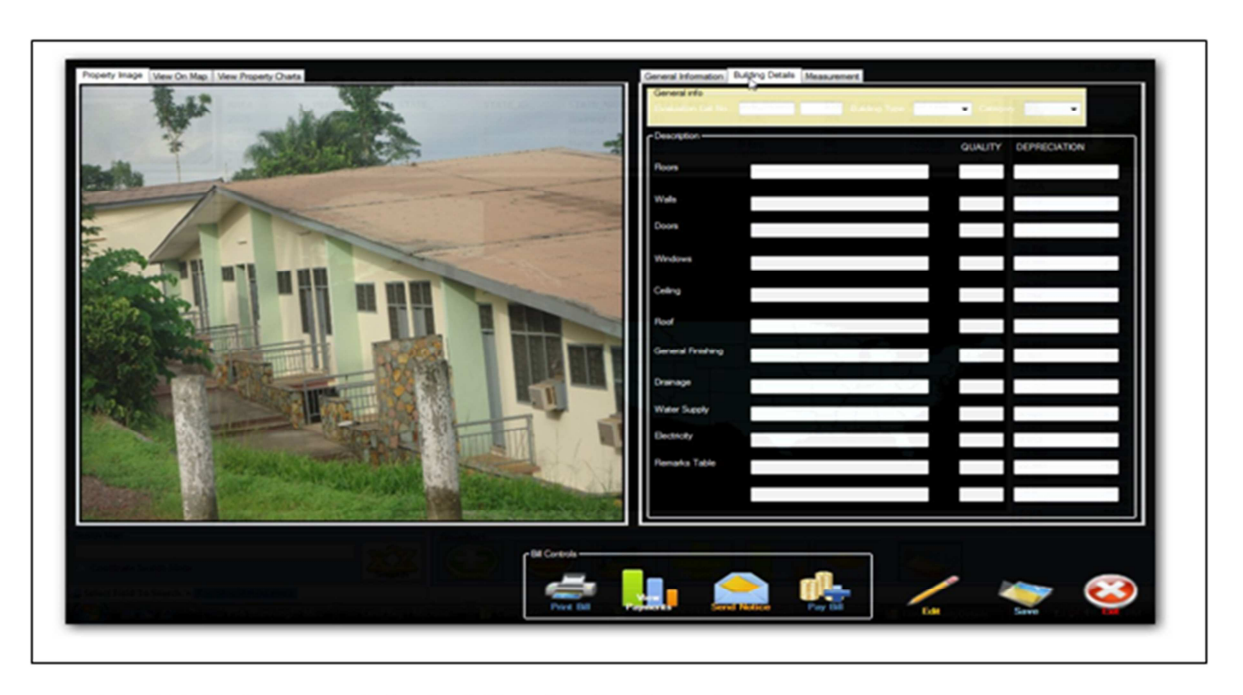
Fig. 7: Window containing building details about the current selected property