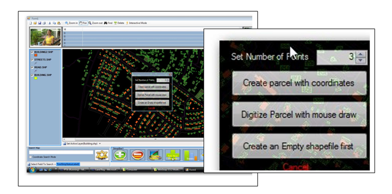
Fig. 5: Add New Property dialog Window