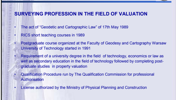
FIG Working Week, 13-17 May 2007, HONG KONG, CHINA