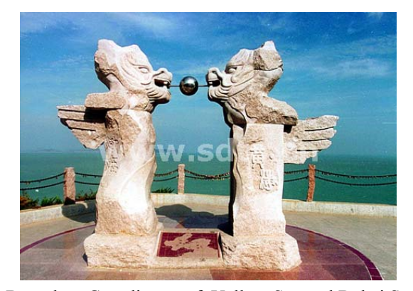
Boundary Coordinates of Yellow Sea and Bohai Sea