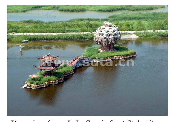
Dongying: Swan Lake Scenic Spot-Stalactite

(2) Tourism industry has good base. The industry size has been augmented and the contributive ratio has been increased,