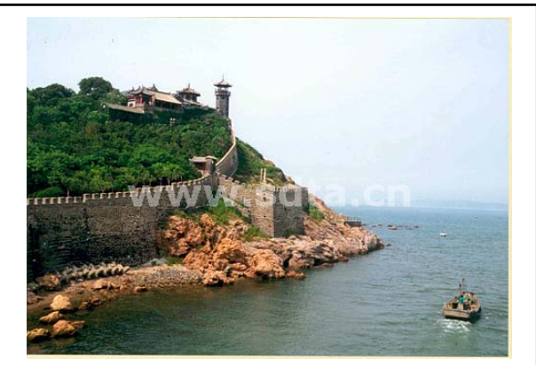
The Overlook of Penglai Pavilion

Weihai: aerial photography of Eight Immortals crossing