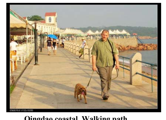
Qingdao coastal Walking path