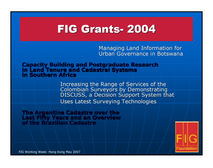
FIG Working Week- Hong Kong May 2007