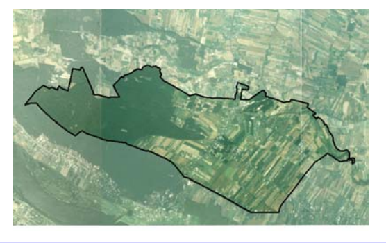
FIG Working Week, Hong Kong 13-17 May 2007