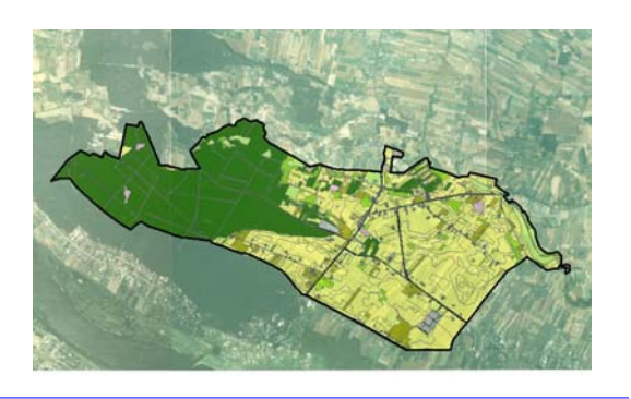
FIG Working Week, Hong Kong 13-17 May 2007