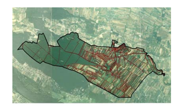
FIG Working Week, Hong Kong 13-17 May 2007