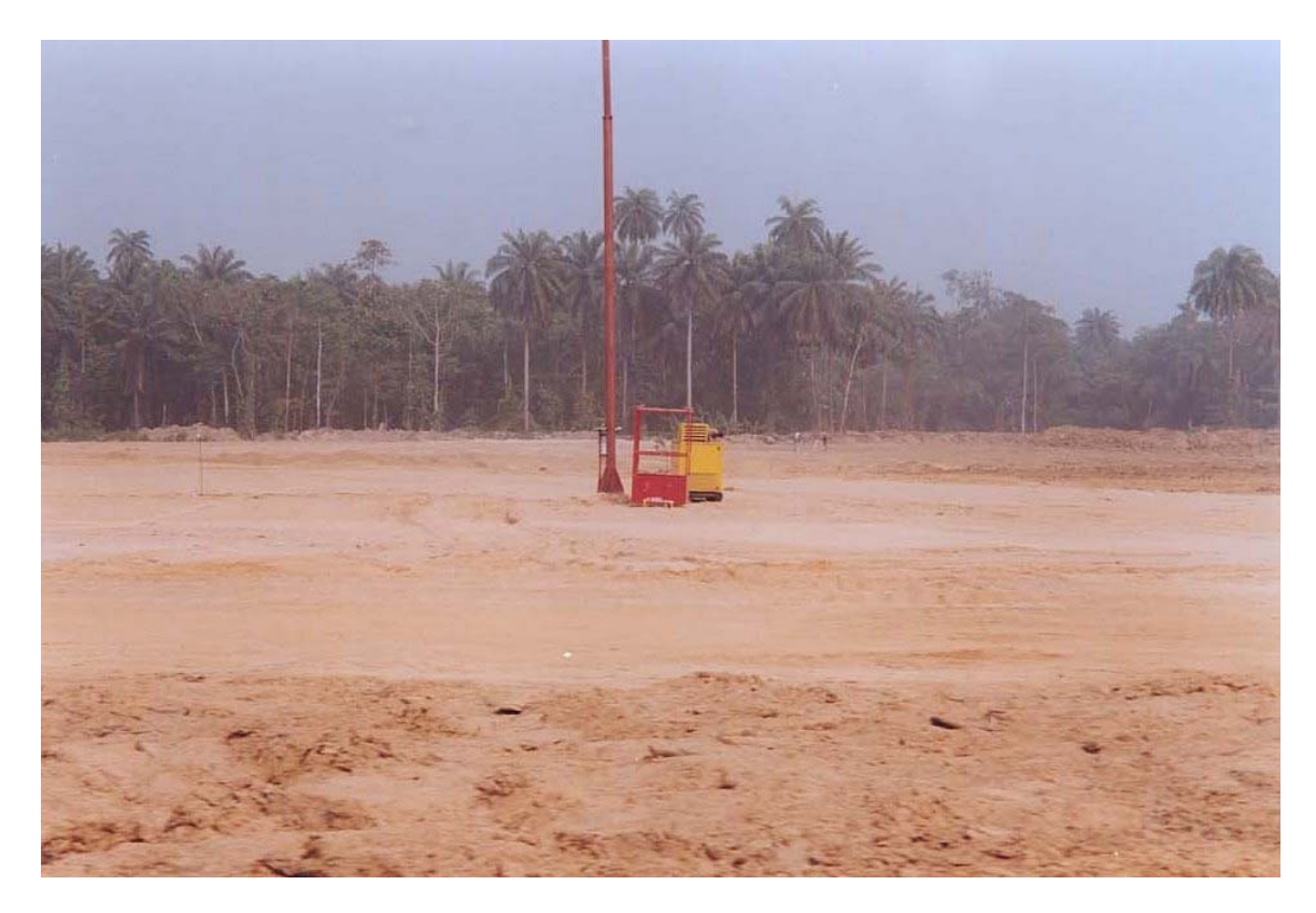
Figure 7: Reclaimed land of the camp

At the moment, 75% of the area has been filled to capacity and work is going on at top speed. Infact the residential area has been completed with all its facilities and the workers are already resident.