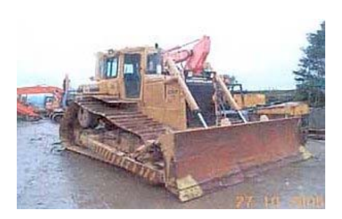
Figure 4D : Catrepillar d6 v-track bulldozer.