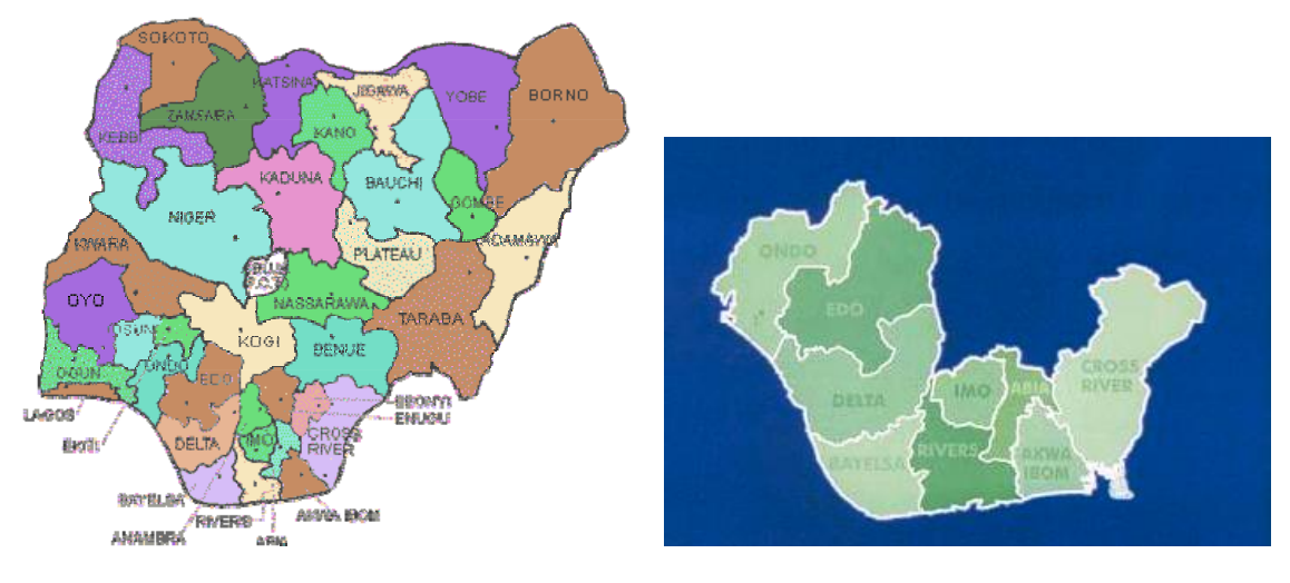
Figure 1 Map of Nigeria