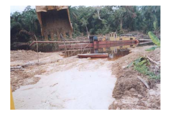
Figure 3B Swamp buggy creating a path into the site for the dredger