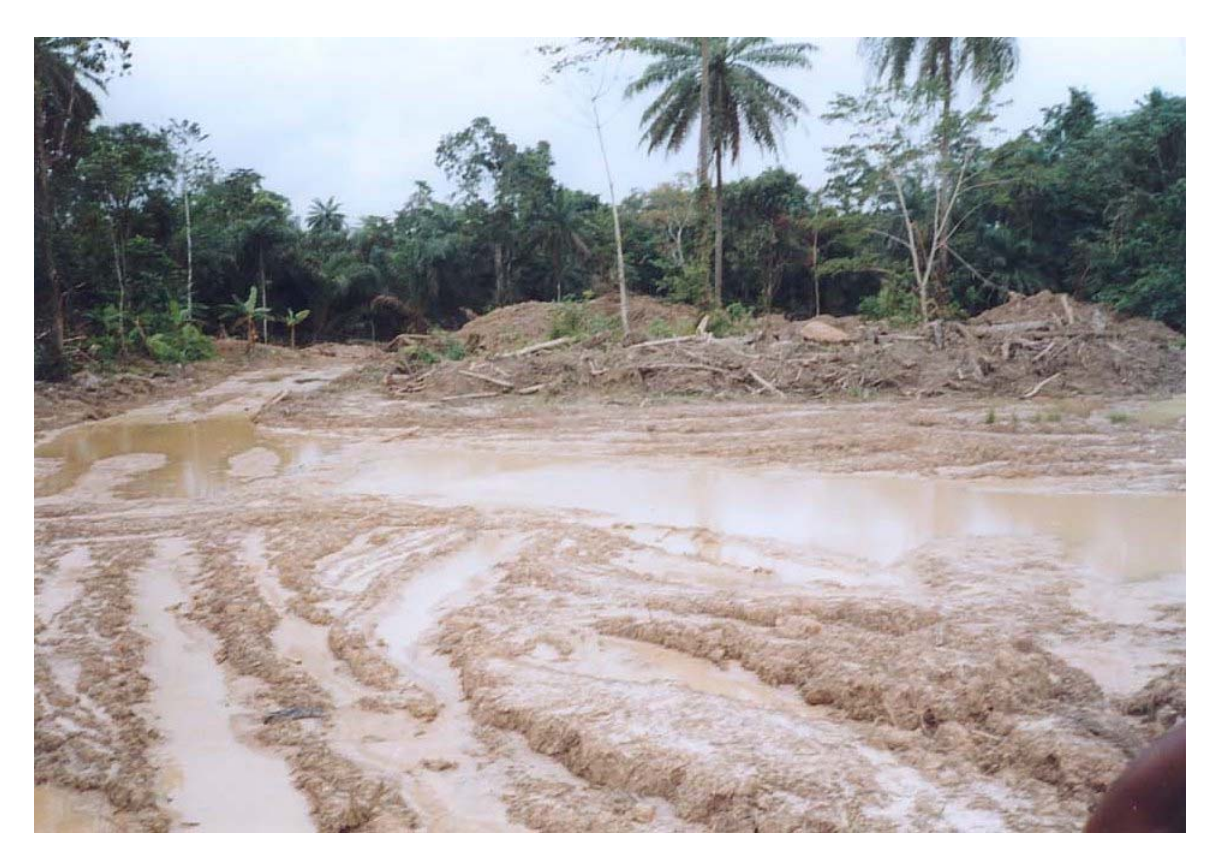
Figure 3A: Saipem camp site prior to reclaimation