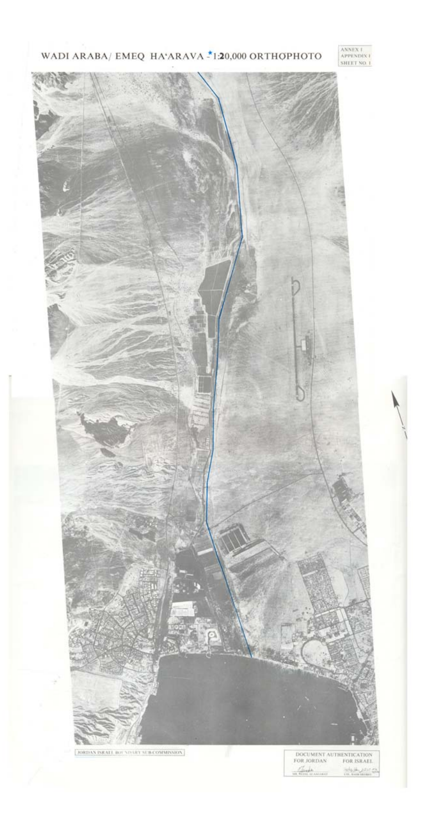
Figure 2: The Israel-Jordan Peace Treaty: The 1<sup>st</sup> orthophoto sheet.

TS 7A - Conflicts – Informal Settlements: Policy and Concepts Haim Srebro A Model of Boundary Delimitation in a Peace Agreement