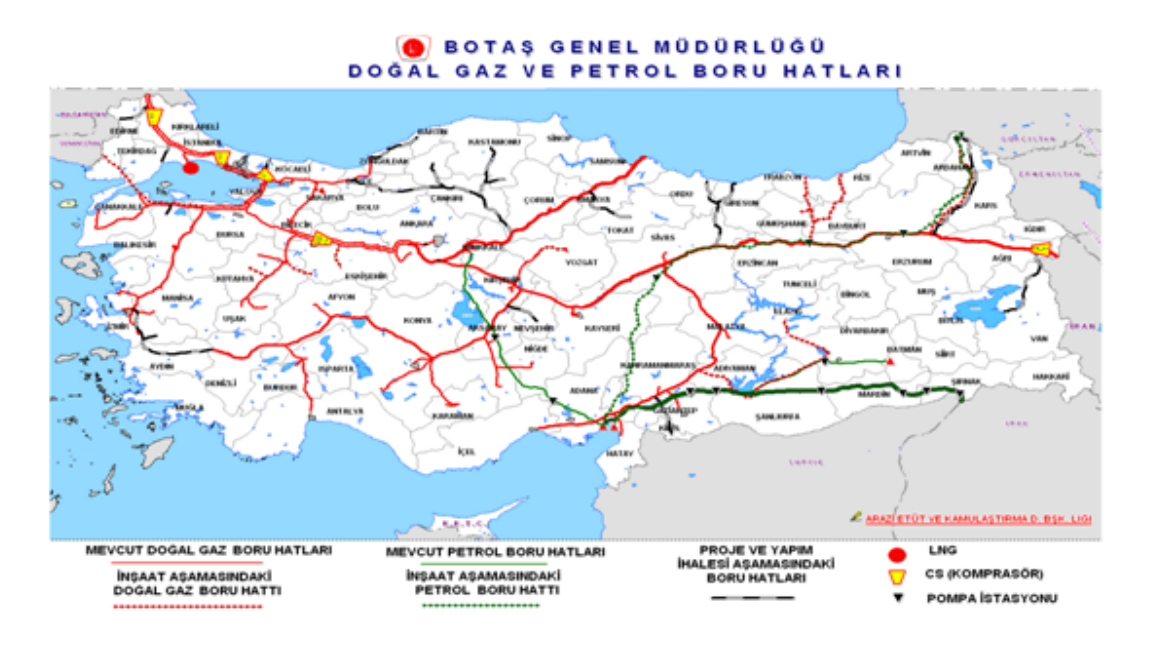
Map 1: National and International petroleum and natural gas pipelines constructed by BOTAS

National and International petroleum and natural gas pipelines constructed by BOTAS can be seen in Map1