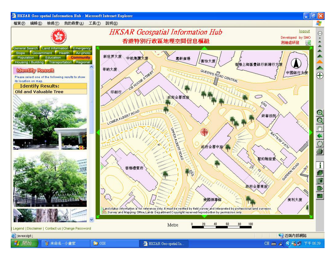
Figure 2: GIH incorporating information of old and valuable trees

Land administration plays a dominant part in the economic and social development of Hong Kong. The Land Administration Office (LAO) of Lands Department is a major group of users of the GIH. The LAO is responsible for the disposal of government land. It acquires private land and clears land required for public works projects. It is also responsible for managing government land to ensure that it is not illegally occupied. The LAO also performs squatter control and clearance duties, processes small house applications and undertake preparatory work on resumption and clearance of land. With the GIH, officers in LAO can search and view the location of a proposal through their desktop computers. Users can also obtain land status and zoning information of the subject and adjoining sites. In lease enforcement operations, officers can study the aerial photos showing the buildings and constructions on a particular site. The GIH also facilitates the slope maintenance activities where case officers can understand the geographic conditions, the as-built features as well as the land parcel information of the subject area. Officers in LAO can also use the GIH to search and locate specific types of buildings by using the GIH. They can also make use of the aerial photos in the GIH to identify the as-built condition of a specific site, e.g. assist in identifying possible illegal structures.