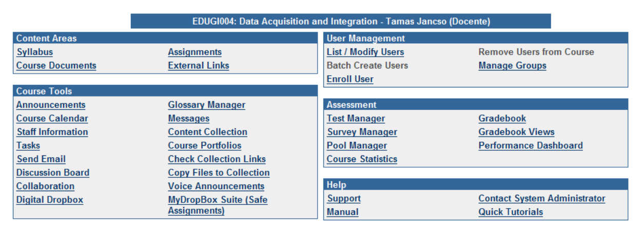
Figure 1: Control panel of the Blackboard e-Learning platform