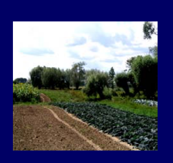
FIG Working Week 2004, Athens, Greece, May 22-27, 2004

Landscape oriented rural land development must be supported by comprehensive studies. The study of value of landscape components is exceptionally important as far as land re-allotment procedure concerns