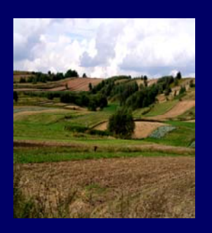
FIG Working Week 2004, Athens, Greece, May 22-27, 2004