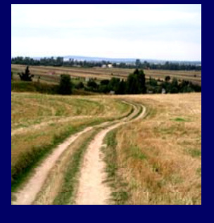
FIG Working Week 2004, Athens, Greece, May 22-27, 2004

PROPOSALS OF PUBLIC FOOTWAYS, BRIDLE PATHS, CYCLE TRAKS AND OTHER POINTS AND LINES OF LANDSCAPE OBSERVATION AND ACCESS TO THE OBJECTS SHOULD BE SCHEDULED