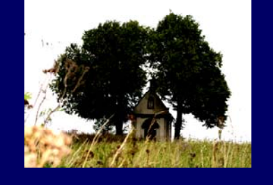
FIG Working Week 2004, Athens, Greece, May 22-27, 2004