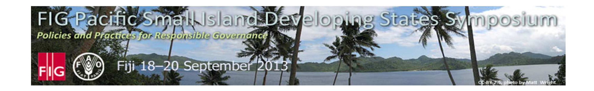
FIG Pacific Small Island Development States

National and Regional Collaboration in Implementing Voluntary Guidelines on Governance of Tenure and Sustainable Development