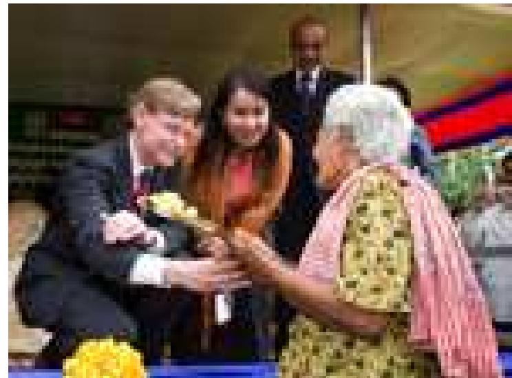
At the land title distribution's ceremony

We are always welcome delegations from other countries to visit us and exchange experiences on land sector.