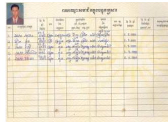
Family register book