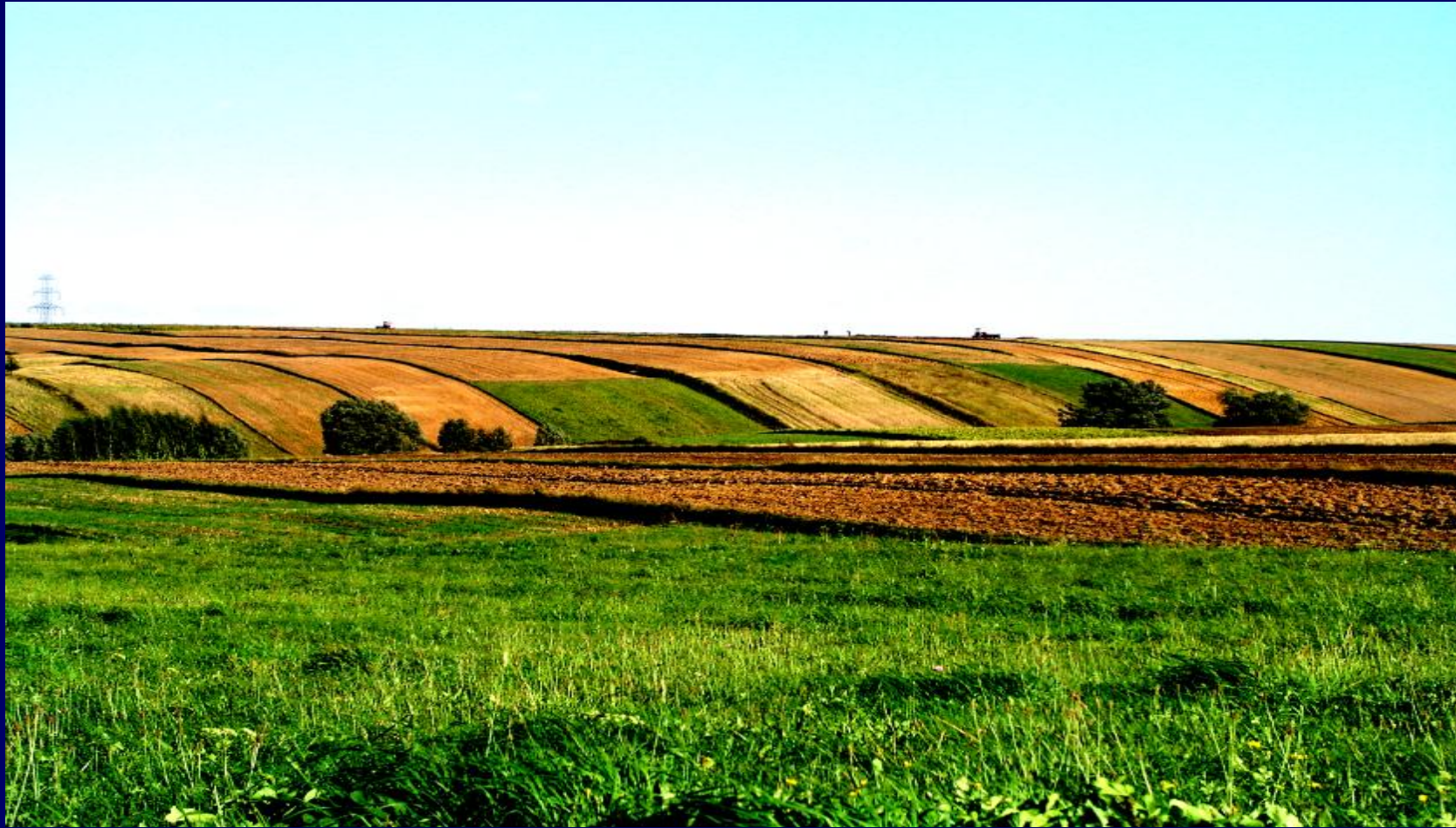
FIG Symposium on Modern Land Consolidation, Volvic (Clermont-Ferrand), France, September 10-11, 2004