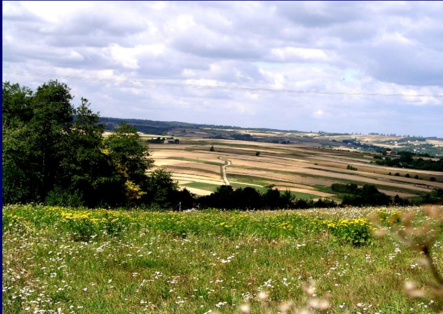
FIG Symposium on Modern Land Consolidation, Volvic (Clermont-Ferrand), France, September 10-11, 2004