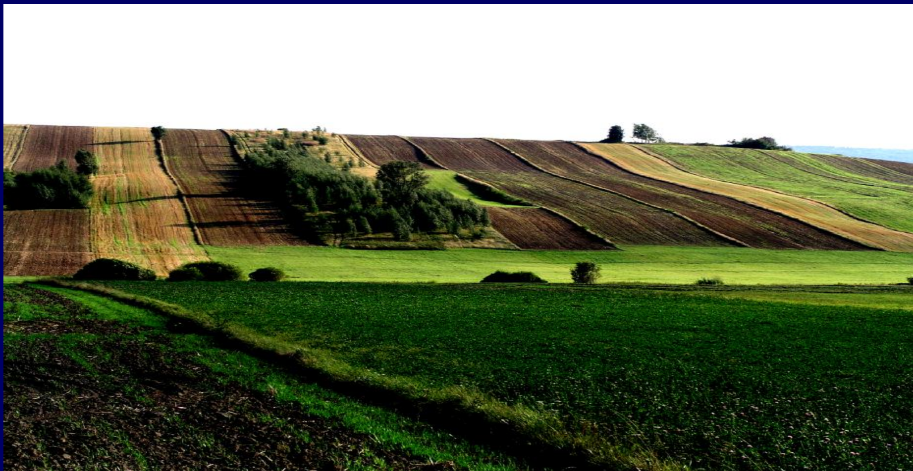
FIG Symposium on Modern Land Consolidation, Volvic (Clermont-Ferrand), France, September 10-11, 2004