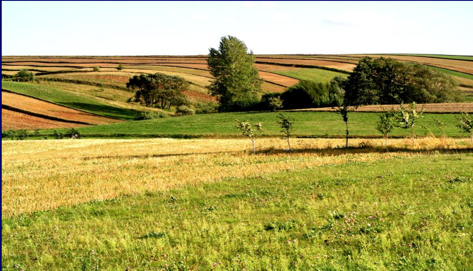
FIG Symposium on Modern Land Consolidation, Volvic (Clermont-Ferrand), France, September 10-11, 2004