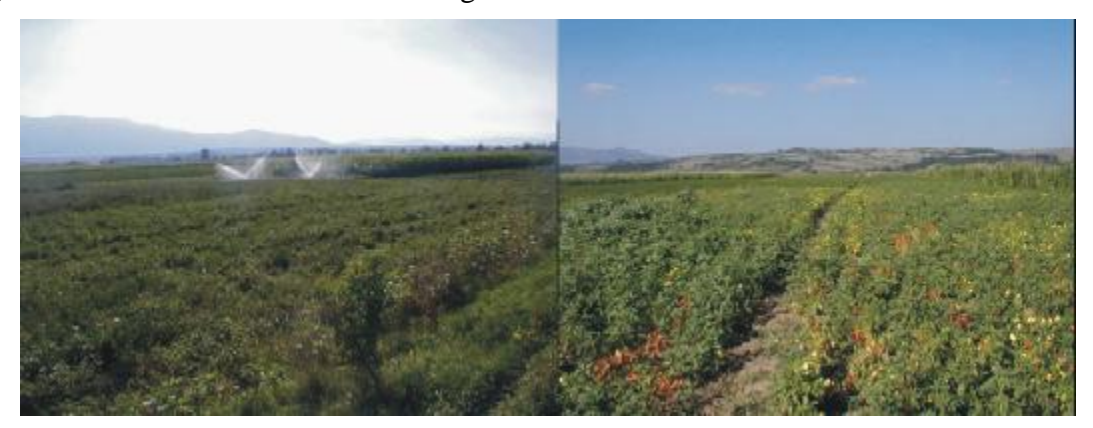
Fig. 3. Photo by Irrigation system and production on area near by Drini river

The made analyse in Drenas for number of family economies it come out that 48% of them are depended from agriculture production from their property, fig. 3., but in conditions as that parcel area has at least 3 ha. Whereas after the land consolidation and making of conditions for irrigation this minimum comes in 1 ha agriculture land.