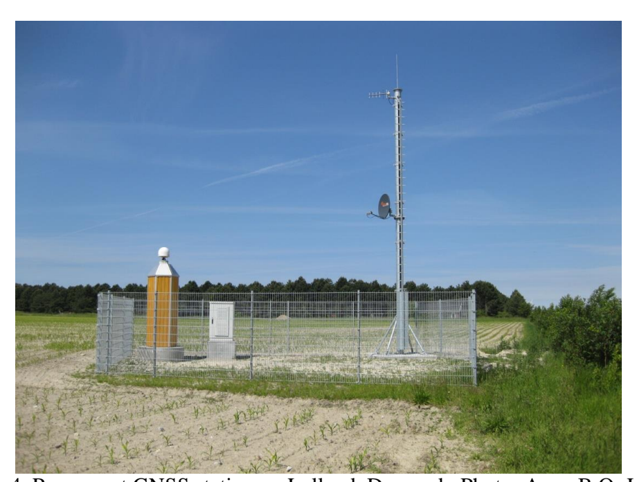
Figure 4. Permanent GNSS station on Lolland, Denmark.

The reference frame chosen is the ITRF2005 (Altamimi et al., 2007) which was the newest and most accurate realization of the ITRS at the time of definition of the reference frame. The four permanent GNSS stations described in the previous section form the local realization of the ITRF2005. This was achieved by using seven days of GNSS data from the four new stations along with data from six surrounding existing permanent GNSS stations of the network of the International GNSS Service, the IGS (Dow et al., 2009).