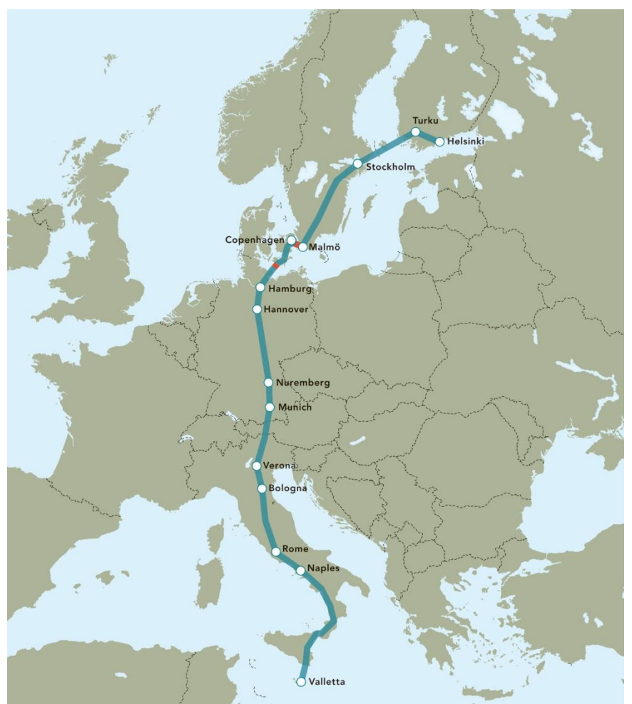
Figure 2. The Scandinavia-Mediterranean corridor. Location of the Fehmarnbelt Fixed Link is marked in red between Copenhagen and Hamburg. Illustration: Femern A/S.

With this paper we describe the solutions and implementations chosen, starting with the establishment of new permanent GNSS stations, selection of geodetic reference system, establishment of geodetic reference frame, definition of new height system, determination of a geoid model, derivation of parameters for coordinate transformations to national reference frames, definition of map projection, and last but not least the establishment of a GNSS RTK service for precise positioning within the construction area. First, however the construction project is introduced in the next section.