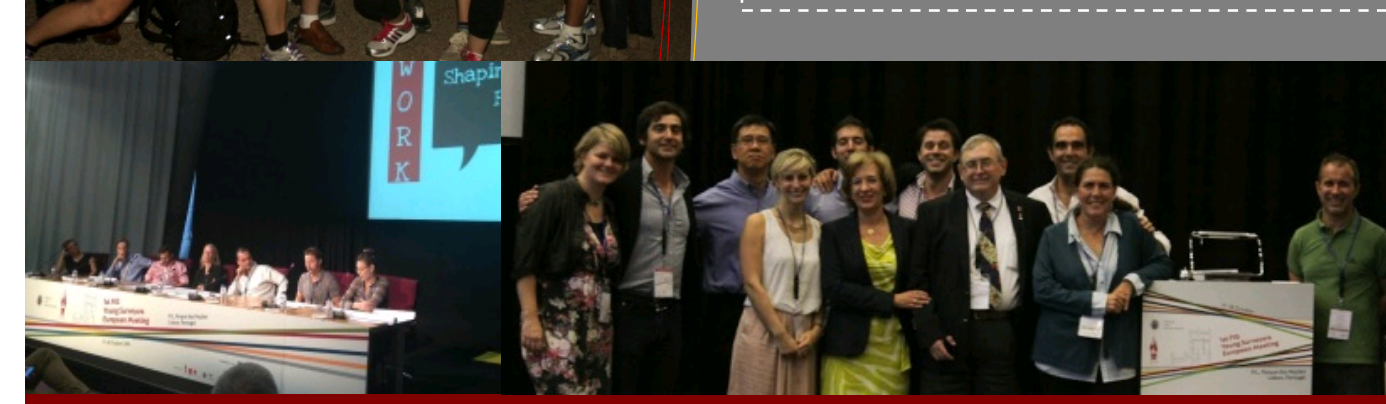
FIG Young Surveyors Network