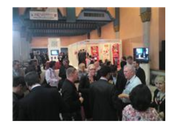
During a coffee break between the afternoon's technical sessions, conference goers gathered in the exhibition area where big and small names exhibited their latest survey equipment and software.

Throughout the week I spent time with members of the FIG Young Surveyors Network at social and formal meets. Though reliant upon email and Skype, the Young Surveyors meet officially every year. Sitting in this meeting I was struck by the global reach of the Network and the wideranging engagement from such a diversity of delegates. Regardless of language barriers, attendees contributed and demonstrated their support for the common goal, to facilitate international networking and opportunities.