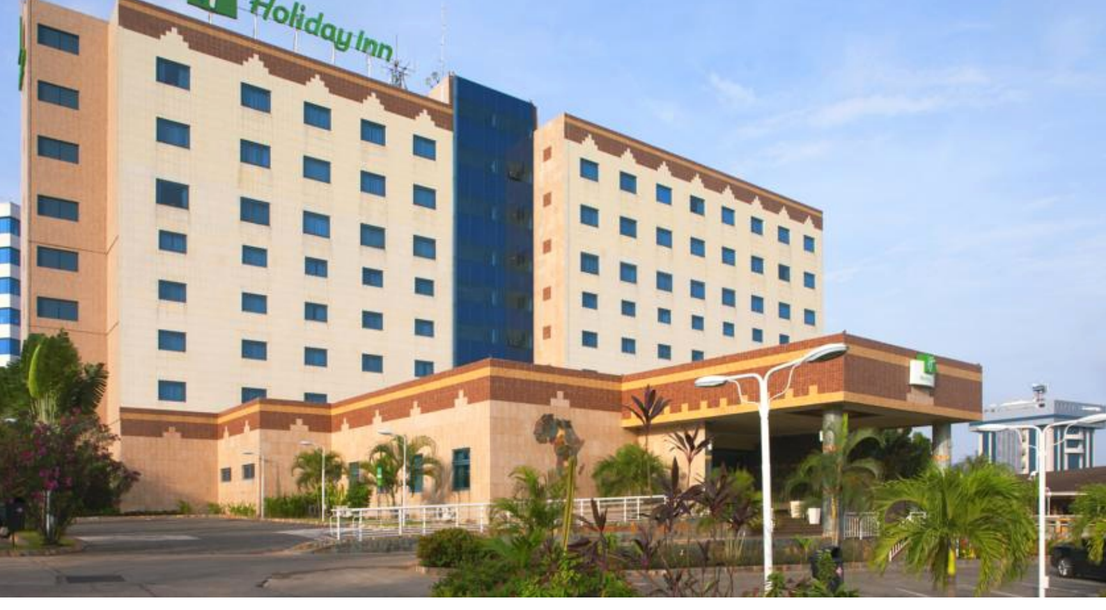
Holiday Inn Hotel, Accra