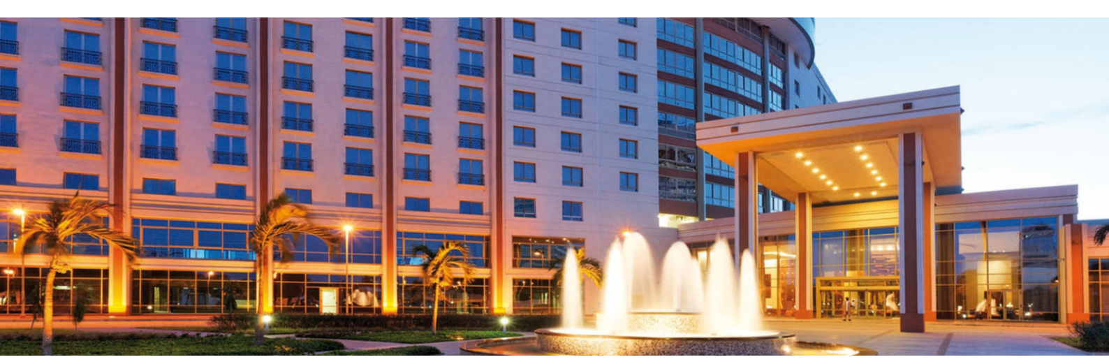
Movinpick Hotel, Accra