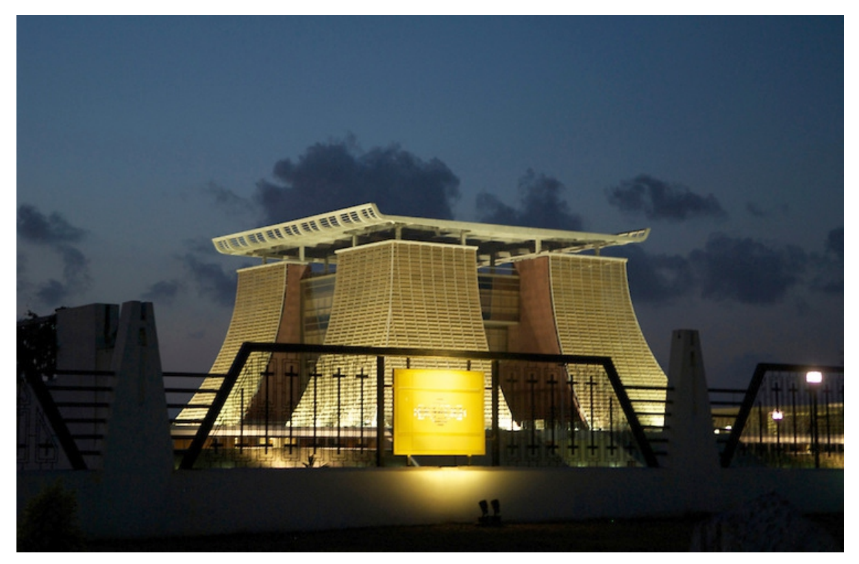
The Flagstaff House, Accra