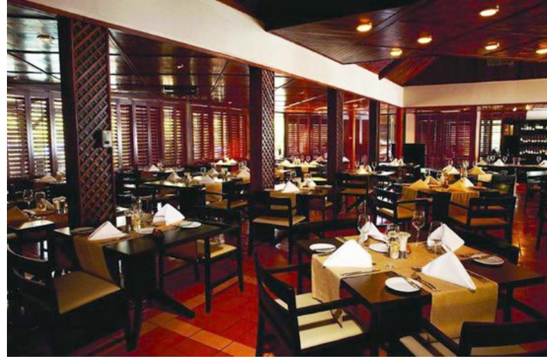
Labadi Beach Hotel, Accra

In conclusion: "Add to this any number of garden bars, inexpensive restaurants and live music venues, and Accra in all its modernity becomes as likeable and absorbing as most African cities."