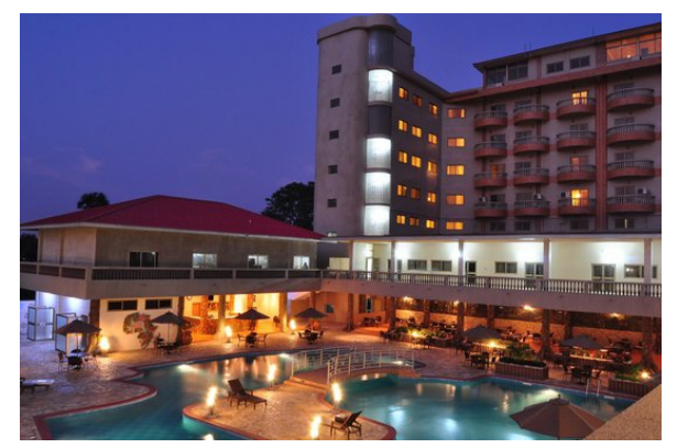
Mensvic Grand Hotel, Accra

he city is acknowledged to have fewer tourist attractions than the other capital cities but both James Town and Osu in Accra have been recognized as having "a certain fading charm, while the frenzied market area and even more Adabraka are vibrantly brashly modern without feeling in any way threatening."