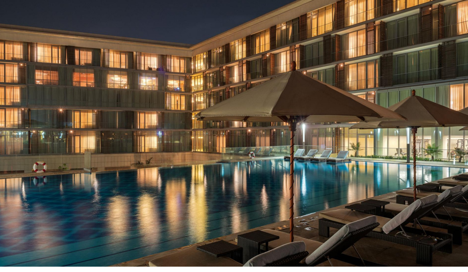
Kempinski Hotel, Accra