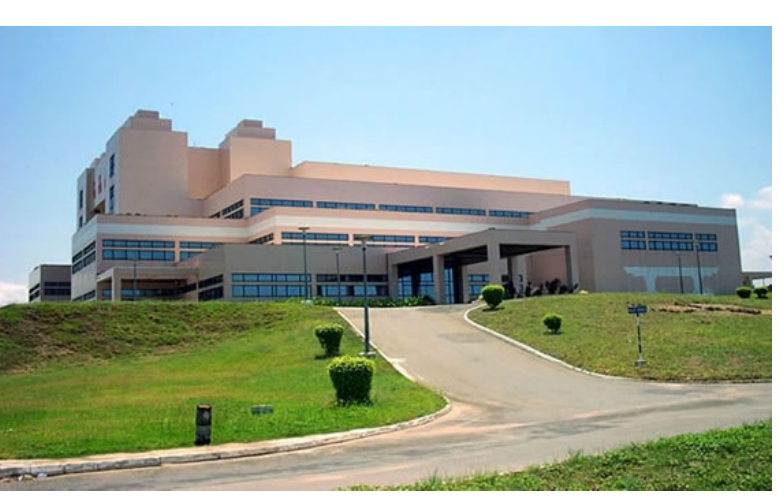
A view of the Accra International Conference Centre (AICC)