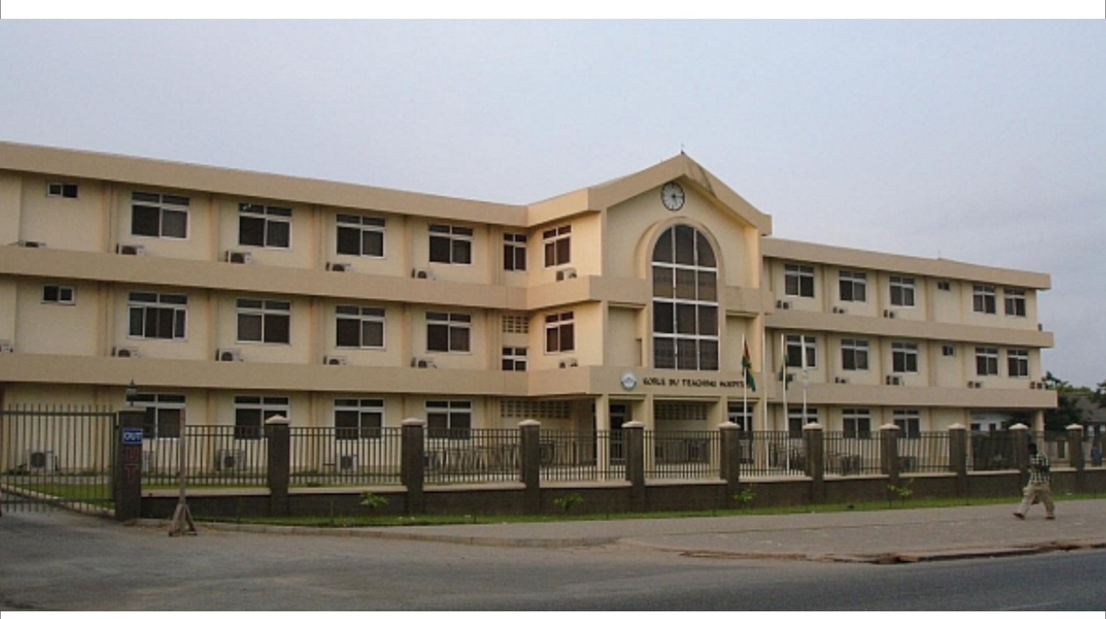
A view of Korle Bu Teaching Hospital