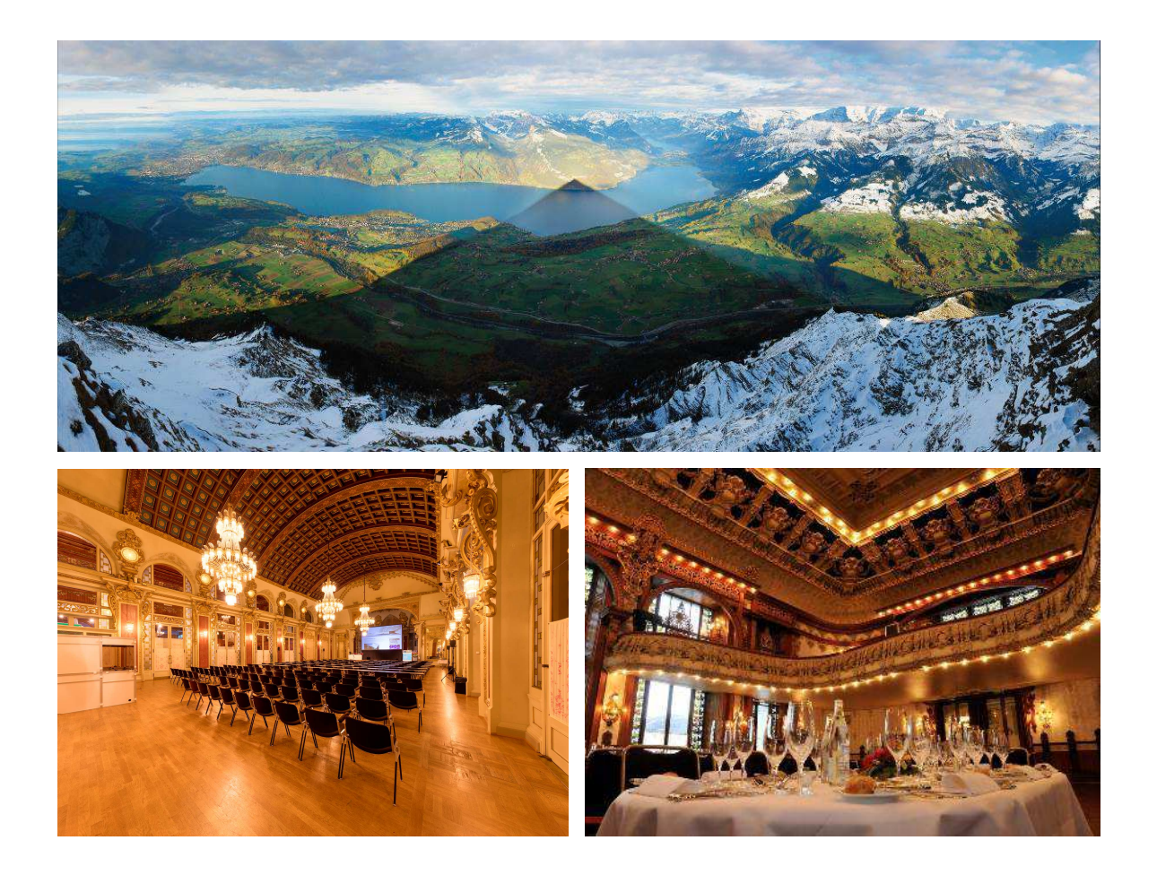
FIG Working Week 2020