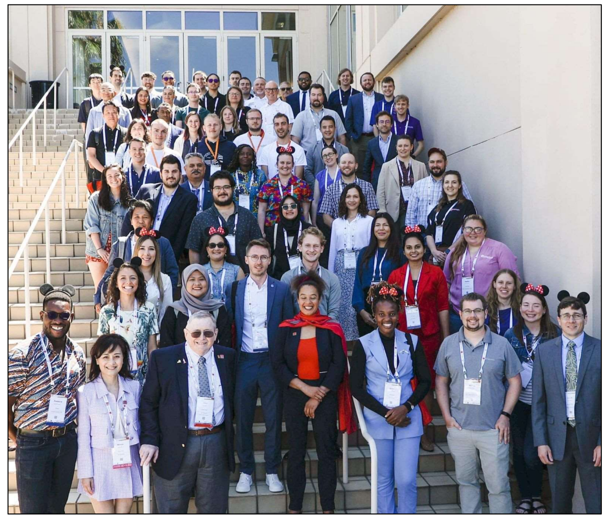
Photo: FIG Young Surveyors Network Conference – 1st Americas Regional Meeting Group Photo.

Coffee breaks and a group photo provided a little stretch of legs and extra energy. And of course, to meet new people and have fun. Hearing presentations and views of other regional young surveyor networks across the globe was insightful and inspiring. We heard from the German Young Surveyors, the Romanian Young Surveyors, and updates from the US territory Puerto Rico.