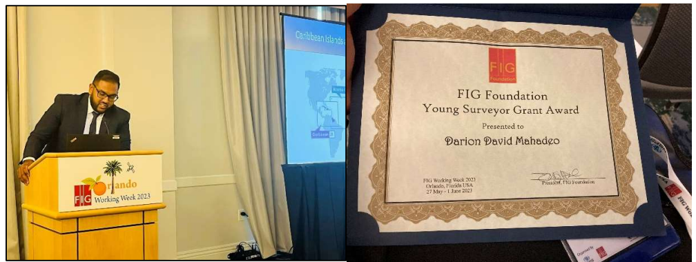
Photos: Left- delivering my FIG Foundation Grant Winner Presentation at the YSN Conference 2023. Right-My certificate from the FIG Foundation Grant Award 2023.