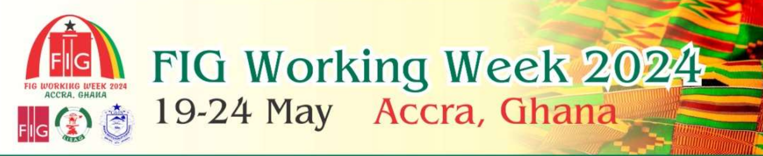
FIG WORKING WEEK